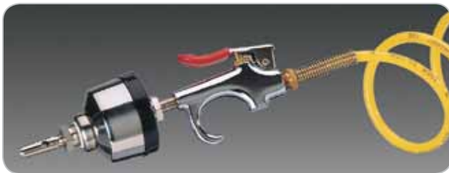
Optional gun/hose kit (p/n 91-6150).